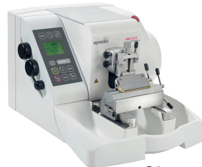
Fully automated HM355S rotary microtome

Optional slide hopper allows for quicker and easier on-demand printing of slides. Slides can automatically feed from the hopper.